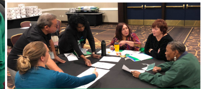
Local 4041 members participating at the leadership conference.