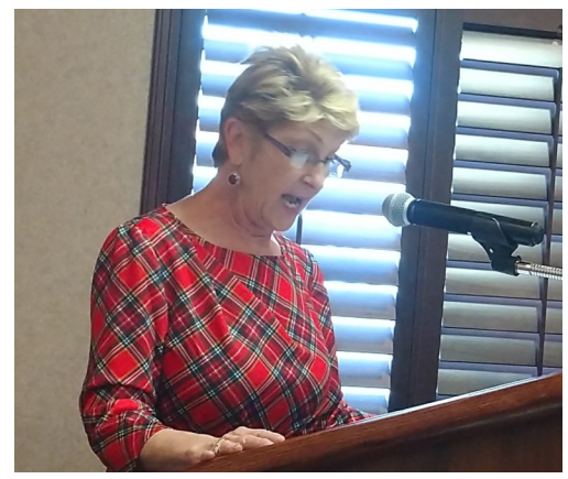
Chis Giunchigliani—Endorsement for Governor