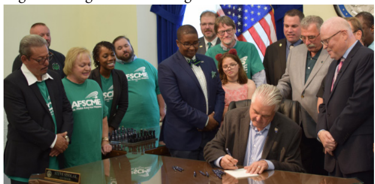
Local 4041 members watch as Gov. Sisolak signs collective bargaining rights for state employees into law.