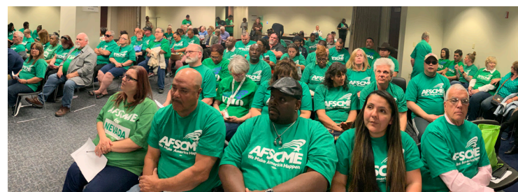
Local 4041 members packed hearing rooms in Las Vegas and Carson City in support of collective bargaining rights during the Nevada legislative session.